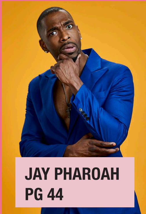
JAY PHAROAH PG 44

The MVCC Cultural Series is one of the biggest entertainment series in the Mohawk Valley, known for bringing world-class events to our campuses in Utica and Rome. The twice-a-year series is organized by the Cultural Events Council, which strives to plan events that reflect and enhance diverse interests to entertain and enlighten both MVCC students and the greater community.