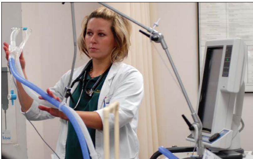
HOW IT WORKS - A nursing assistant holds up breathing tubing which is part of ventilator during a demonstration to SUNY Morrisville nursing students on the Utica Campus.