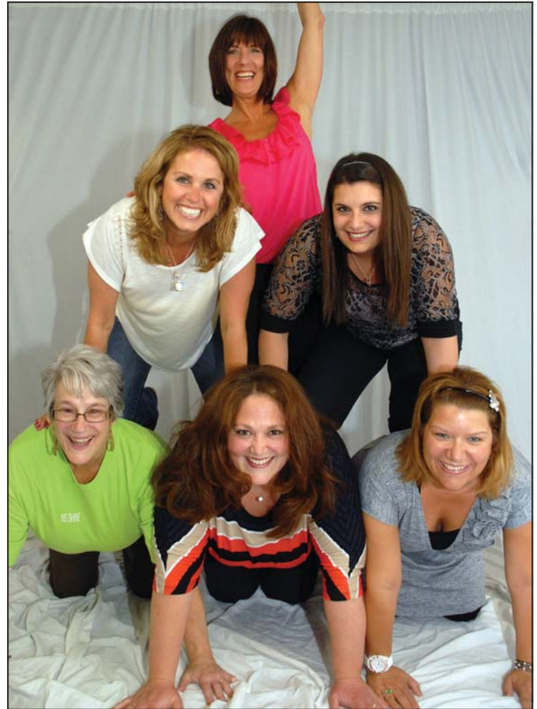
SUPPORTING ONE ANOTHER - Members of the Kiddie Campus Child Care Center were in a celebratory mood after achieving accreditation.

body. The staff also demonstrated early childhood management and leadership expertise among the teachers, teaching assistants and director.