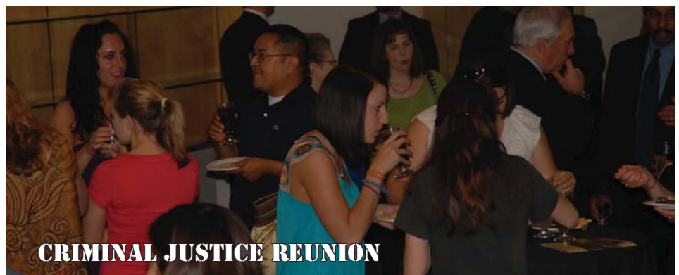
CRIMINAL JUSTICE REUNION