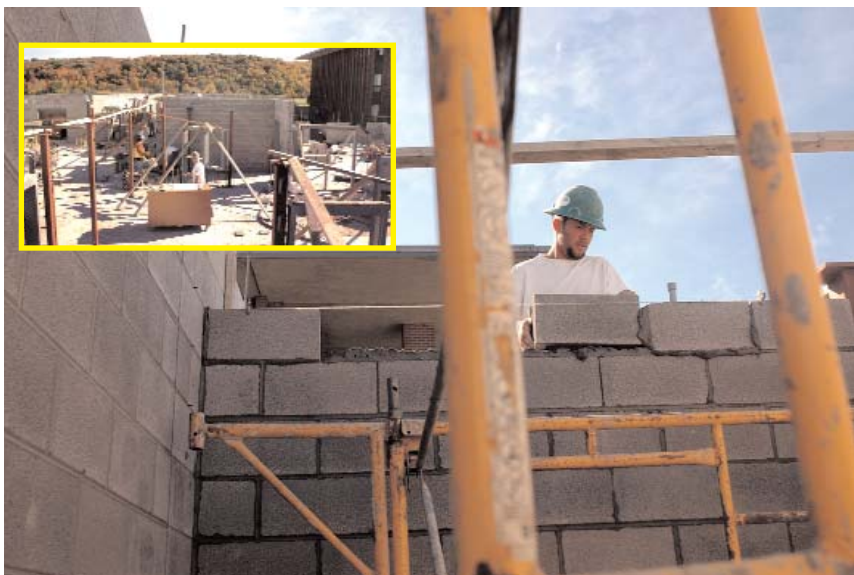
Construction continues on the new Residence Hall