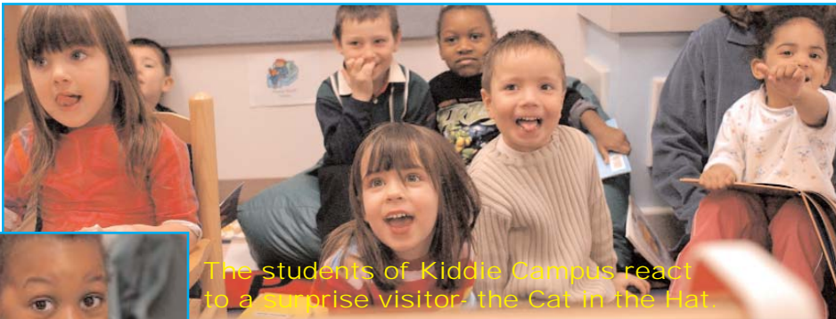
The students of Kiddie Campus react to a surprise visitor: the Cat in the Hat.