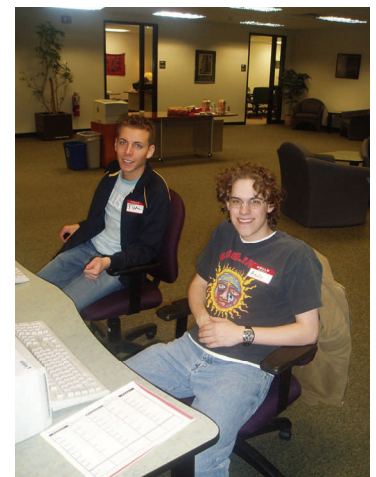
MVCC students web schedule at the computers in the Student Service Center